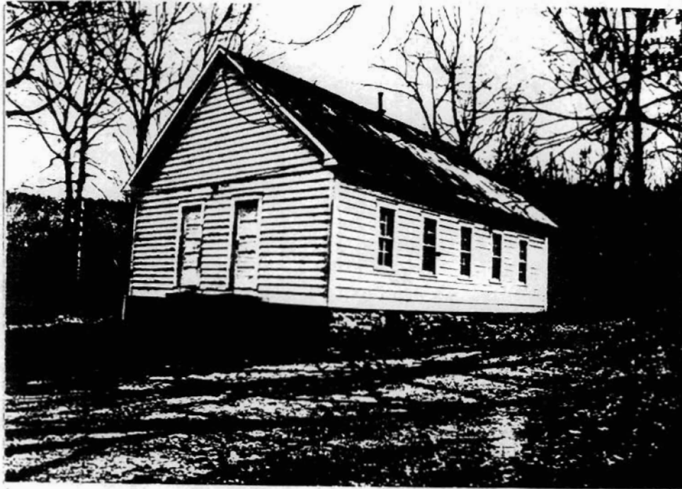
Historic Resources of Stone County Turkey Creek Church & School, ST-142 Turkey Creek Negative on file at the AHPP Viewed from the northwest