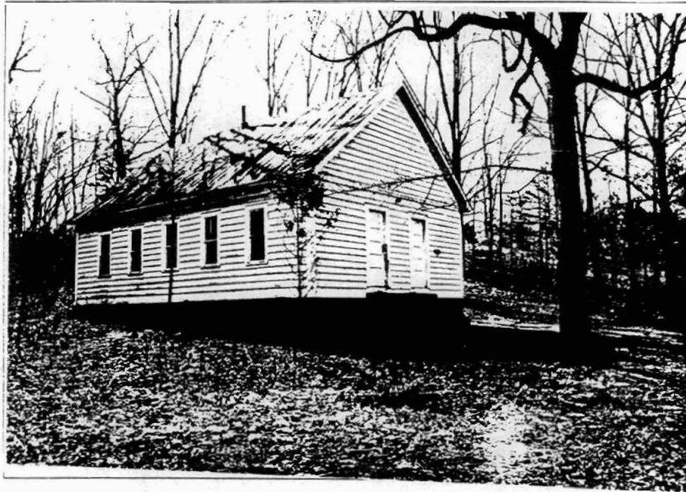
Historic Resources of Stone County Turkey Creek Church & School, ST-142 Turkey Creek Viewed from the northeast