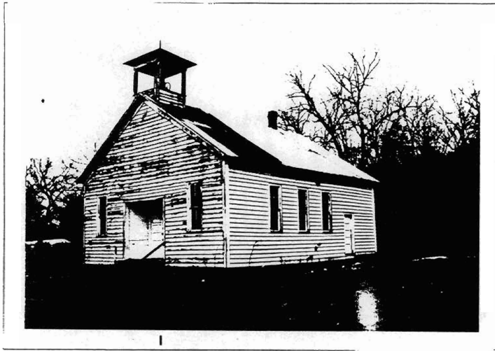
Historic Resources of Stone County West Richwoods Church & School, ST-124 West Richwoods Viewed from the northeast