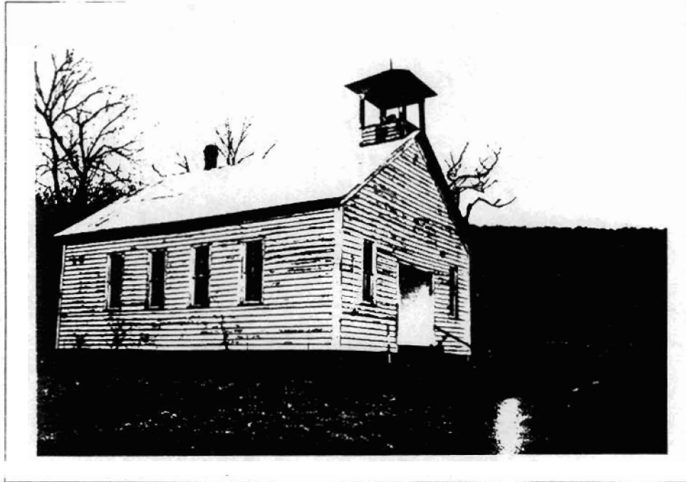
Historic Resources of Stone County West Richwoods Church & School, ST-124 West Richwoods 1983 Negative on file at the AHPP Viewed from the southeast