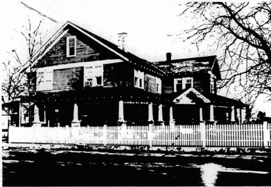
Historic Resources of Stone County Dew Drop Inn, ST-109 Mountain View Viewed from the south