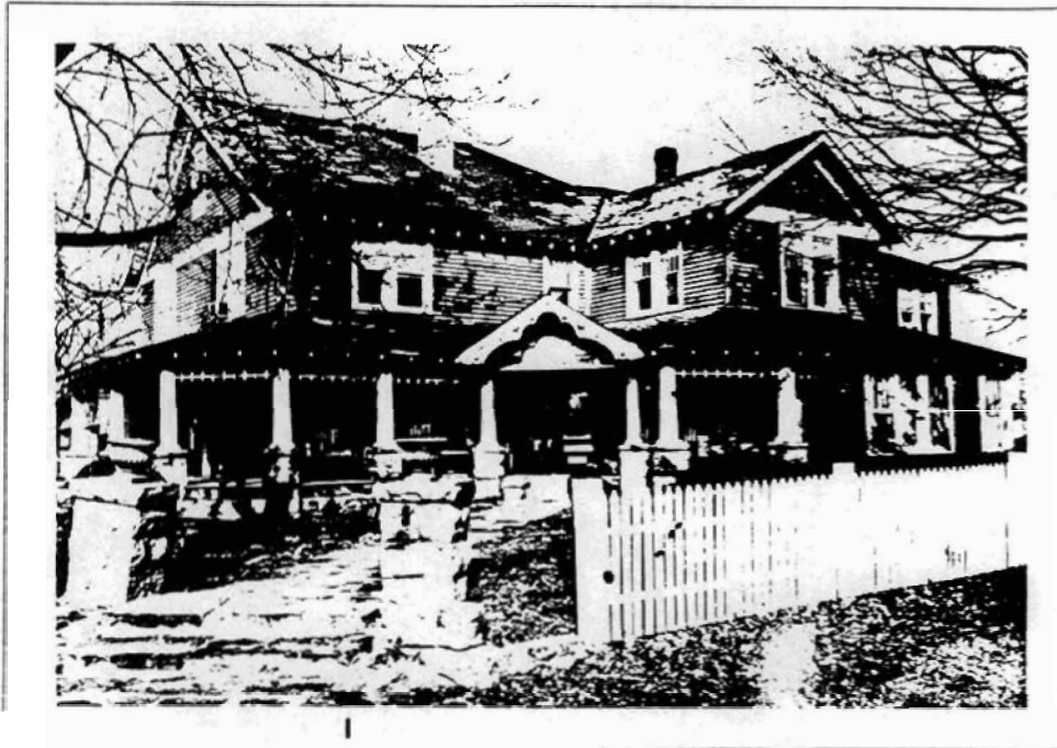
Historic Resources of Stone County Dew Drop Inn, ST-109 Mountain View Don Brown, photographer 1983 Negative on file at the AHPP Viewed from the southeast