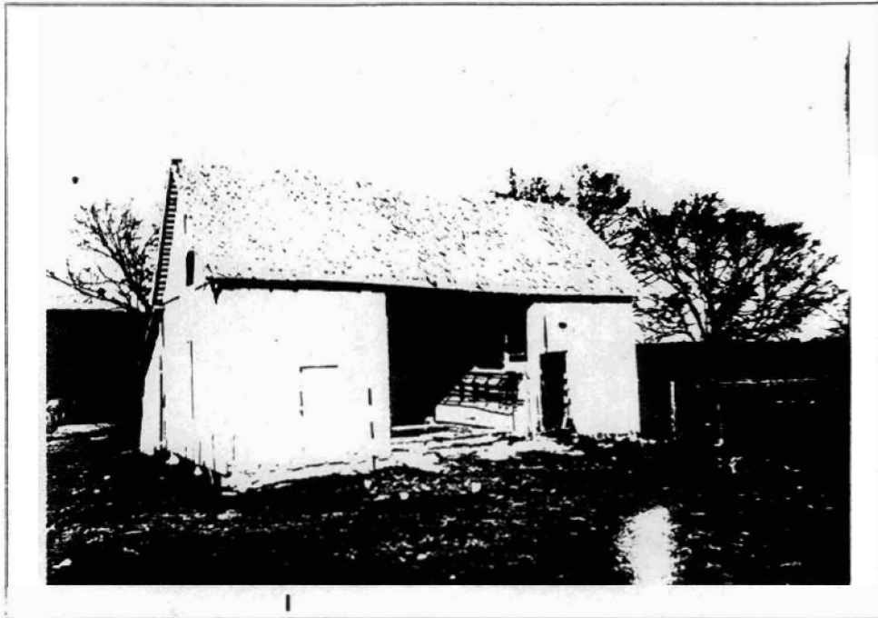
Historic Resources of Stone County Okey Davis Barn, ST-56 Pleasant Grove vicinity 1983 Negative on file at the AHPP Viewed from the south