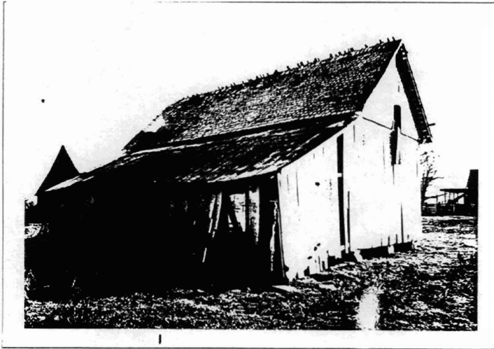
Historic Resources of Stone County Okey Davis Barn, ST-56 Pleasant Grove vicinity 1983 Negative on file at the AHPP Viewed from the northwest