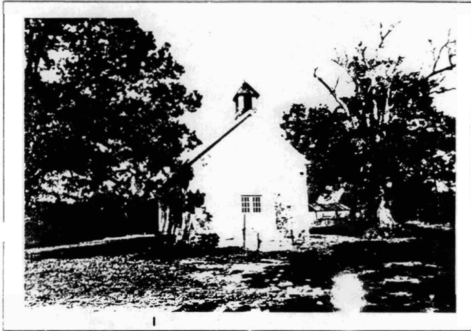
Historic Resources of Stone County Marcella Church and School, ST-23 Marcella Viewed from the east