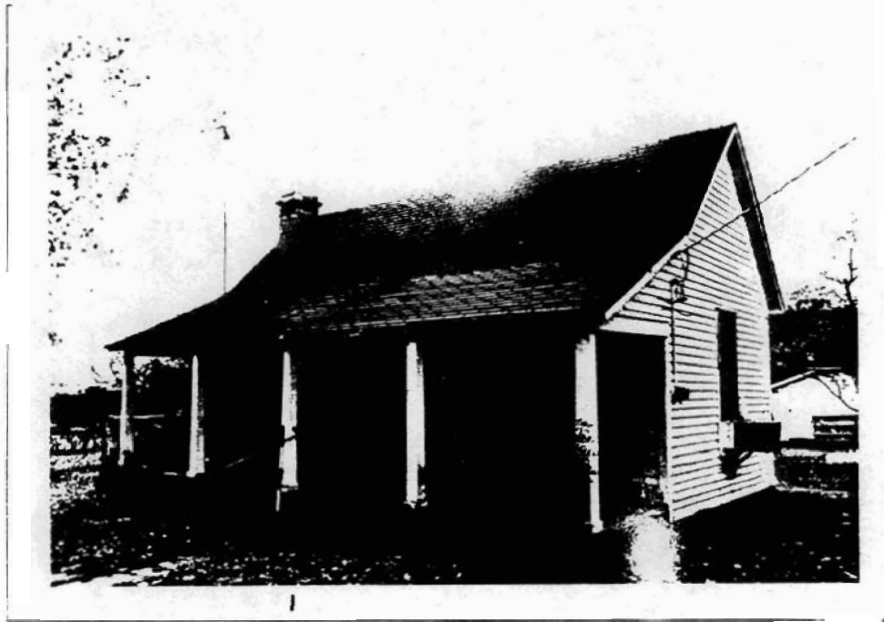
Historic Resources of Stone County Owen Martin House, ST-22 Marcella 1983 Negative on file at the AHPP Viewed from the northwest