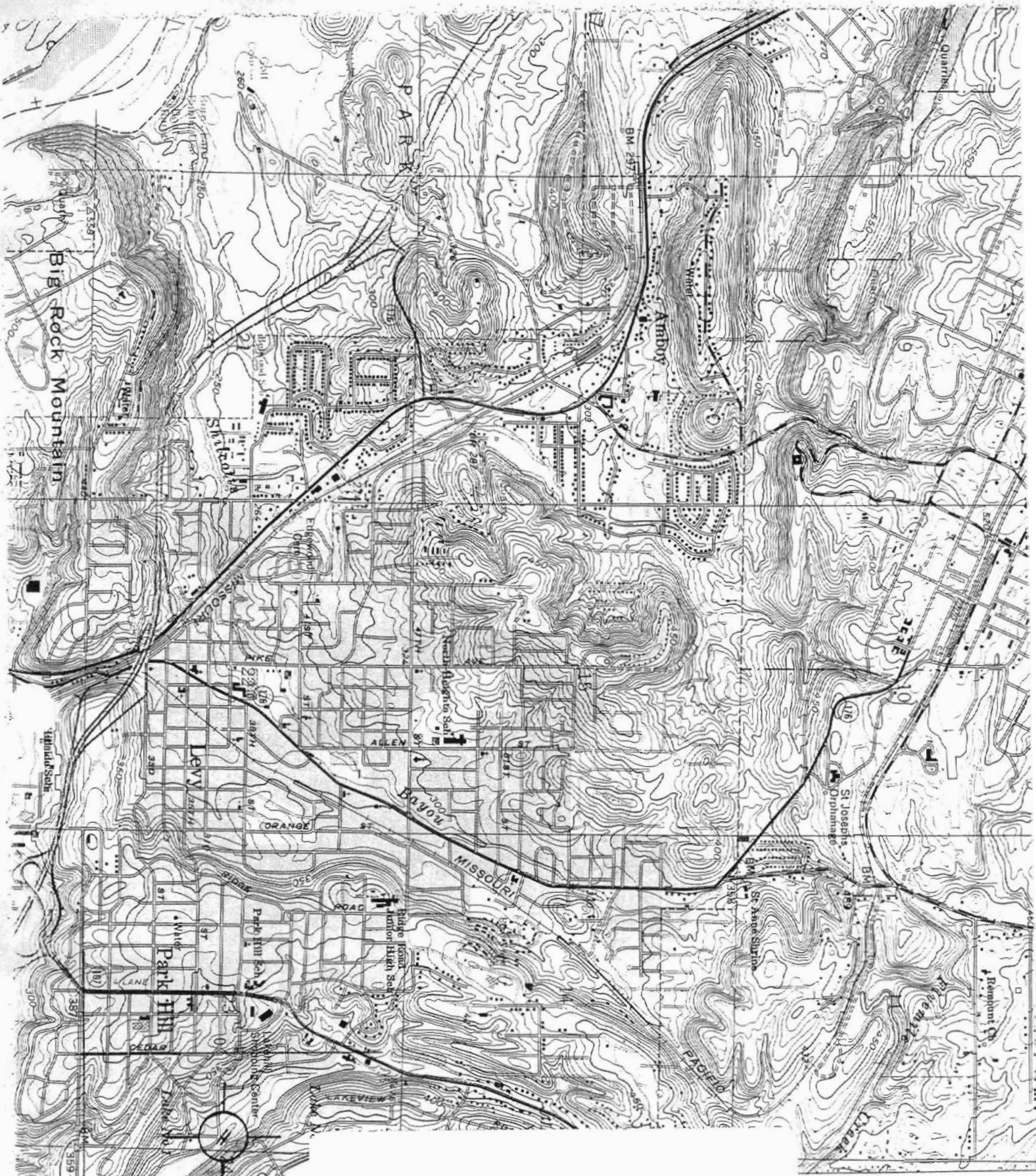
Lake No. 1 Bridge North Little Rock, Arkansas Pulaski County A) 15/568420/3849700 North Little Rock Quadrangle 1:24,000