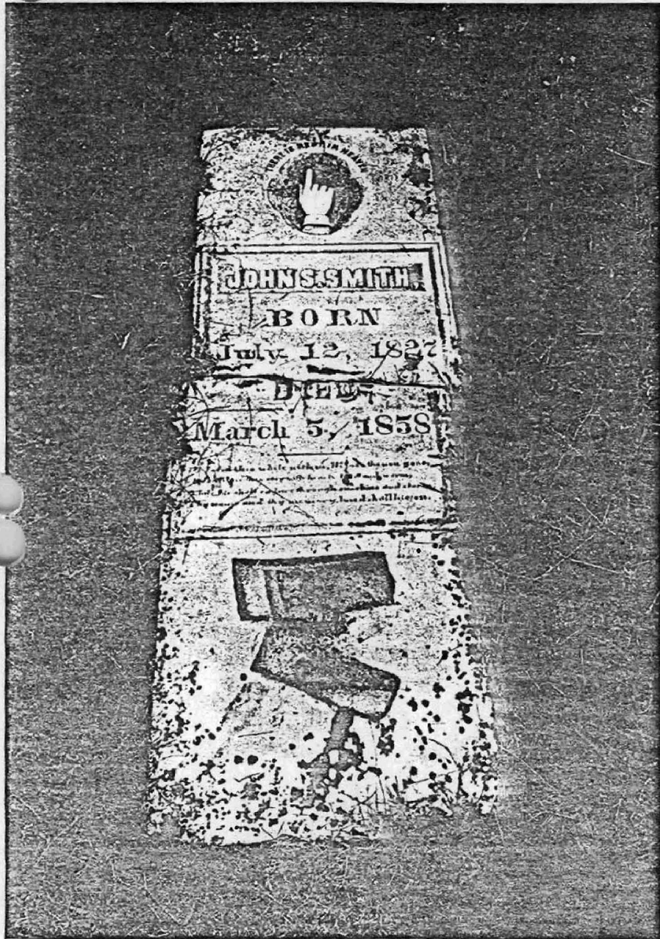
DA-7 Tulip Cemetery Don Brown, photographer June 8, 1982 Negative on file at the AHPP View from the East