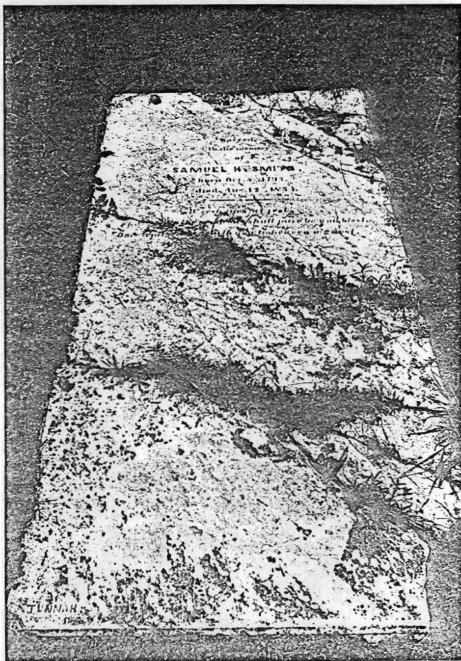
DA-7 Tulip Cemetery Don Brown, photographer June 8, 1982 Negative on file at the AHPP View from the East