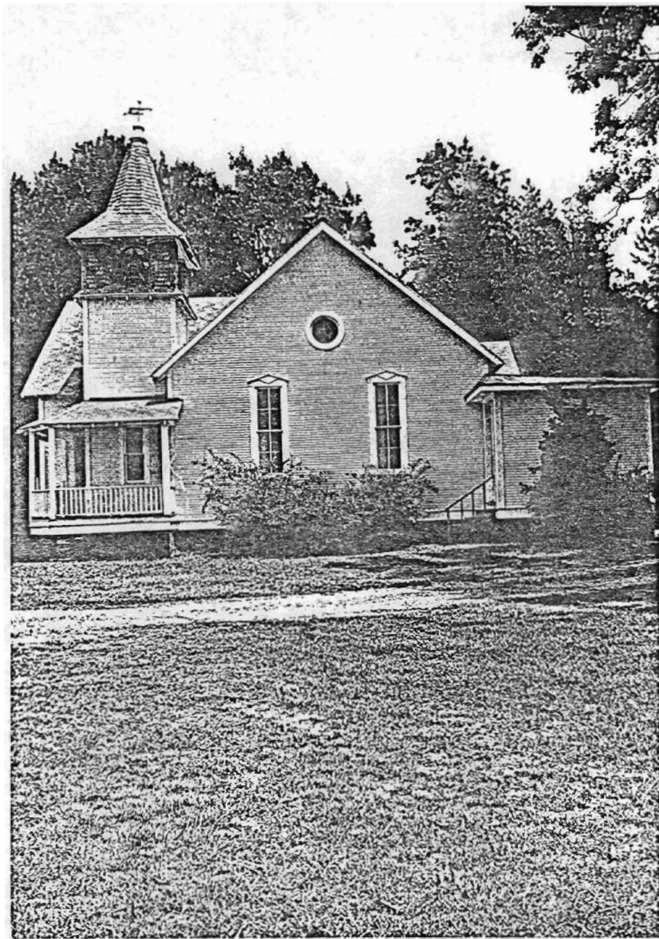
DA-22 Sardis Methodist Church May 18, 1982 Negative filed at the AHPP View from the South