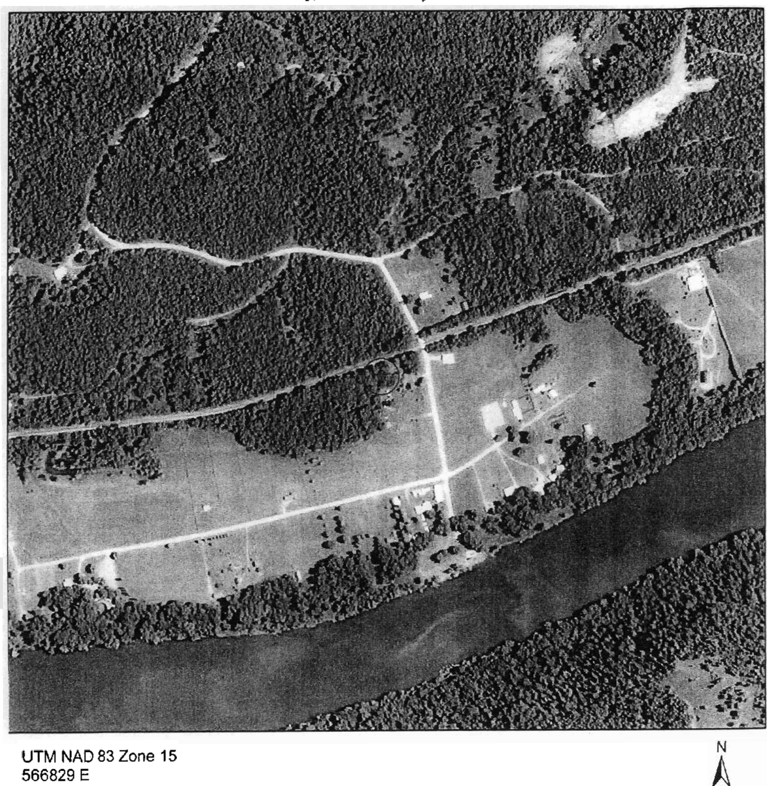
Wolf Cemetery, Baxter County Road 68, Norfork