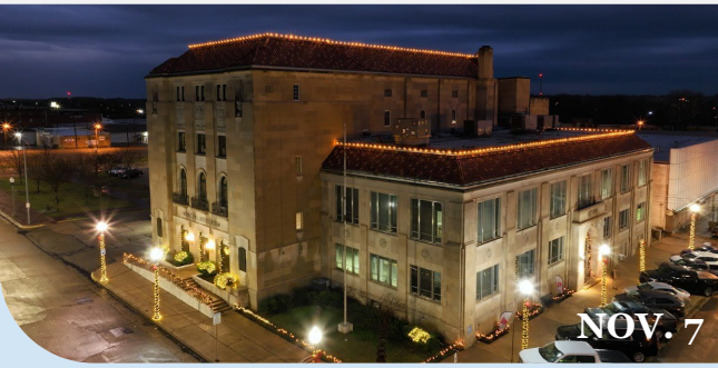
Arkansas Municipal Auditorium, Courtesy of the City of Texarkana, 202

NOTE: The auditorium is only accessible via two flights of stairs. We realize this may be a problem for some, and we hope to live-stream the tour online for those unable to attend physically.