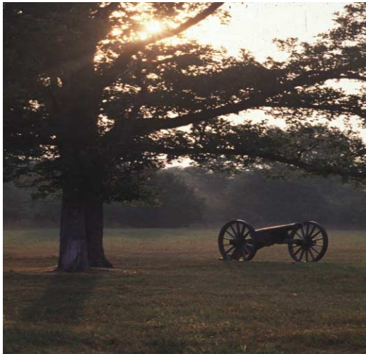
View of Pea Ridge Battlefield. Photo courtesy of the Arkansas State Parks; Little Rock, Arkansas.

May 26: Confederate armies located west of the Mississippi River surrender.